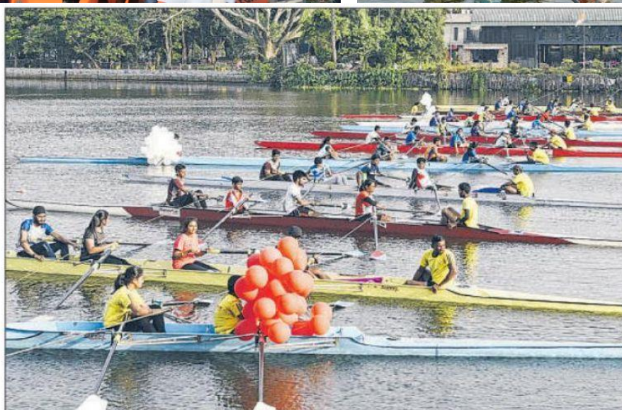
Participants during the inauguration of the Lake Club-organised All-India Invitation School Regatta, at Rabindra Sarobar, on Sunday. More than 370 rowers from 58 schools from different parts of the country are taking part in the meet.